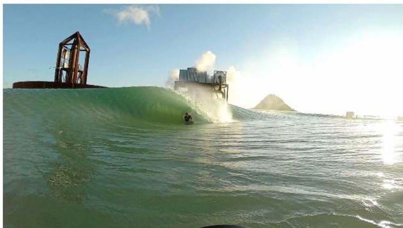
Ben Player threads through a bomb on The Island at Surf Lakes research and development facility near Yeppoon

The prototype machine and the surrounding reefs were created to demonstrate the capability of Surf Lakes unique 5 Waves technology after years of extensive small-scale prototyping, testing and CFD modelling.